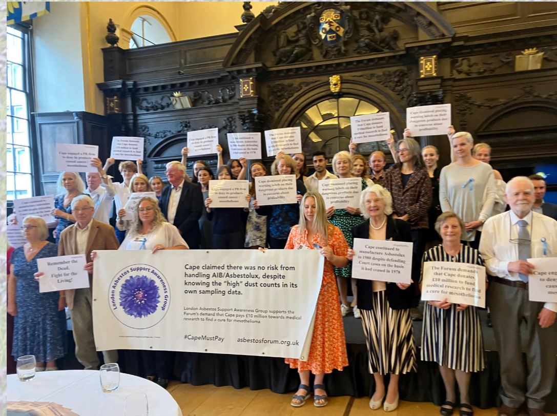
Photo shows those attending our London Action Mesothelioma Day event supporting the #CapeMustPay campaign