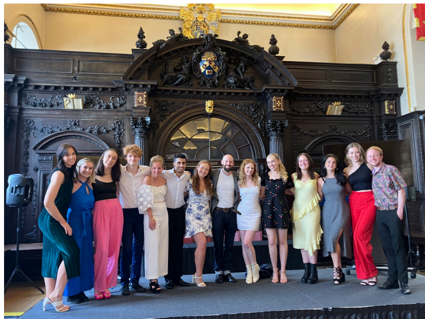
Photo shows students of the Brighton Academy, who provided excellent entertainment!